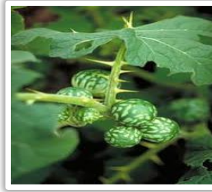
Tropical Soda Apple

For information on how to control these pests and remove efficiently please visit Weeds by common name .