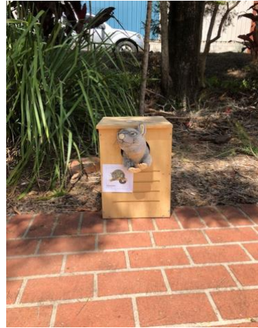
Large Nesting Box - $30.00