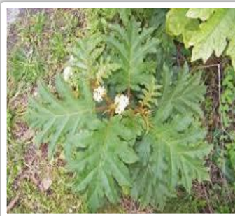
Giant Devil's Fig