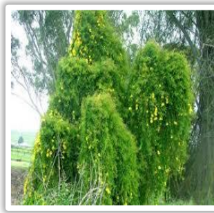
Cat's Claw Creeper