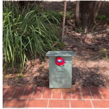
Small Nesting Box - $22.00

We currently have a range of sizes, priced accordingly from $22.00 - $30.00. Call Rob to arrange collection on 0437 866 911.