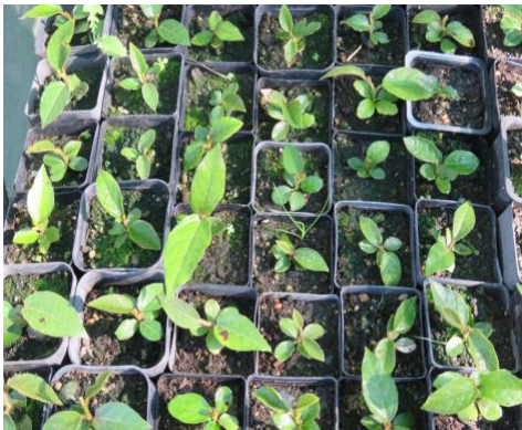
Bird Wing Butterfly vines